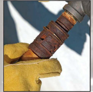
Steel locking sleeves rust and seize (above). Campbell's ZA sleeves don't!