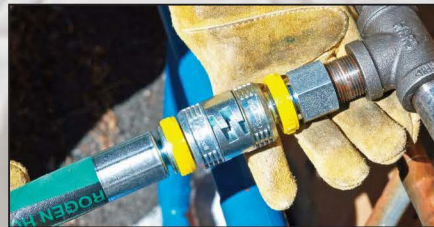
Use Campbell fittings with Nitrogen-Only Warning Rings on the hose and manifold to avoid deadly cross connections